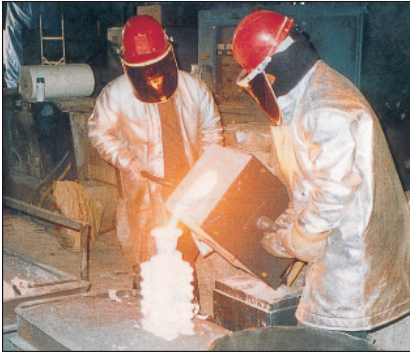
Table Mount Furnace Repairs and Rebuilds have more options available to users

The majority of metal melted and poured with induction furnaces comes from large batch melting induction systems. However, a significant contributor to overall metal poured capacity is the Table Mount Furnace. With capacities from 3 to 90 pounds, the Table Mount Furnace is a staple in the investment casting and precious metal industry.